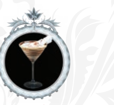
S'MORES $19 Non-Alcoholic $13 You'll want to cozy up next to a campfire as you sip on this marriage of marshmallow and chocolate with a graham cracker rim.