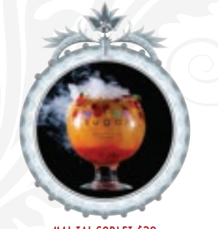
MAI TAI GOBLET $39 Non-Alcoholic $29

You can't help but play with your food when you order this fresh and fruity rum-peach based cocktail. It will be as much fun to drink as it is to fish out the worms!