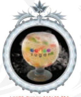
WHITE GLIWWI CUBIET $39 Non-Alcoholic $29

left wondering what now?! Designed and tasted by Kevin Hart