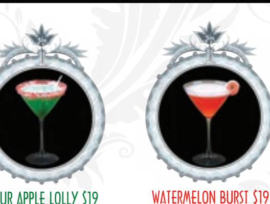
SOUR APPLE LOLLY $19 Non-Alcoholic $13 Non-Alcoholic $13 The crisp taste of watermelon You'll feel nostalgic after the bursts from the glass. After first sip of our liquefied sour apple lollipop. Rimmed with one taste of this delightful Bubble Gum Pop Rocks® this treat you'll wonder where martini finishes with a bang! the candy wrapper is.