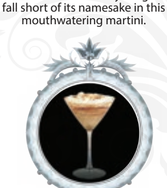
CARAMEL MACCHIATO $19 Non-Alcoholic $13 Our version of the espresso martini brings the robust flavor of coffee together with the silky to add another layer of delight.