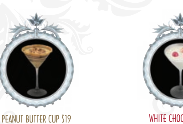
WHITE CHOCOLATE $19 Non-Alcoholic $13 No chocolate cocktail menu would be complete without a white chocolate martini. We bring together the delicate taste of vanilla and white chocolate in this little piece of paradise.